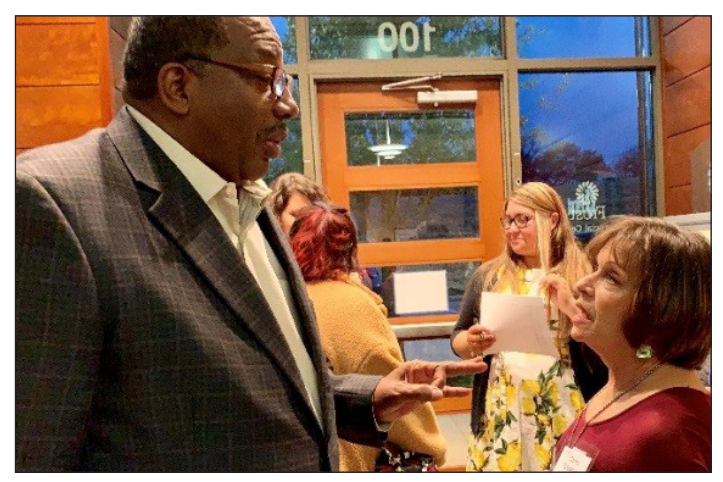
Sen. Royce West (D-23)